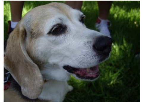
Bessy the dog ☺