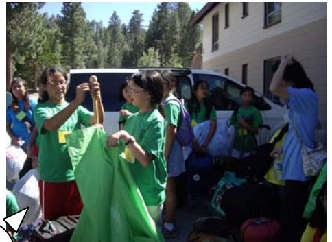
Top Right: Arriving at camp!