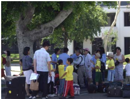
Checking in for camp!